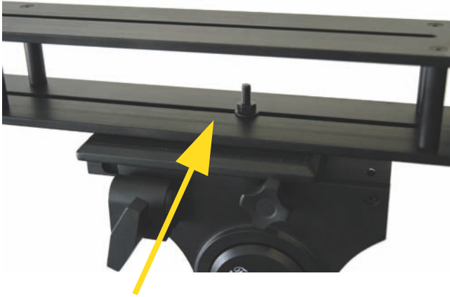
Attach mount to your tripod quick release plate