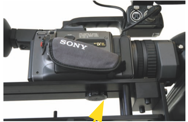
Attach your camera to the top of mount